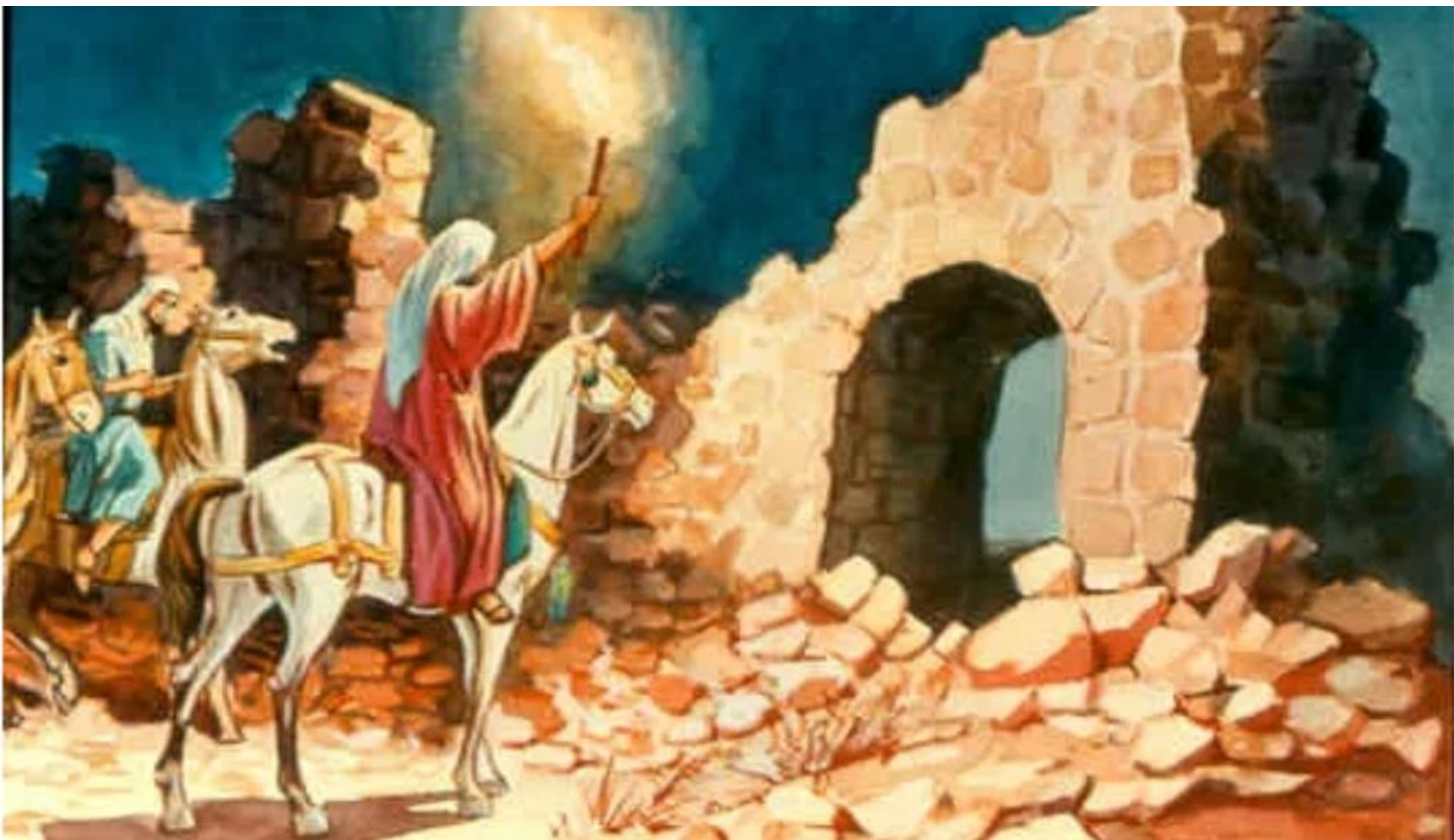
Nehemiah's nighttime ride (inspects the city's walls)