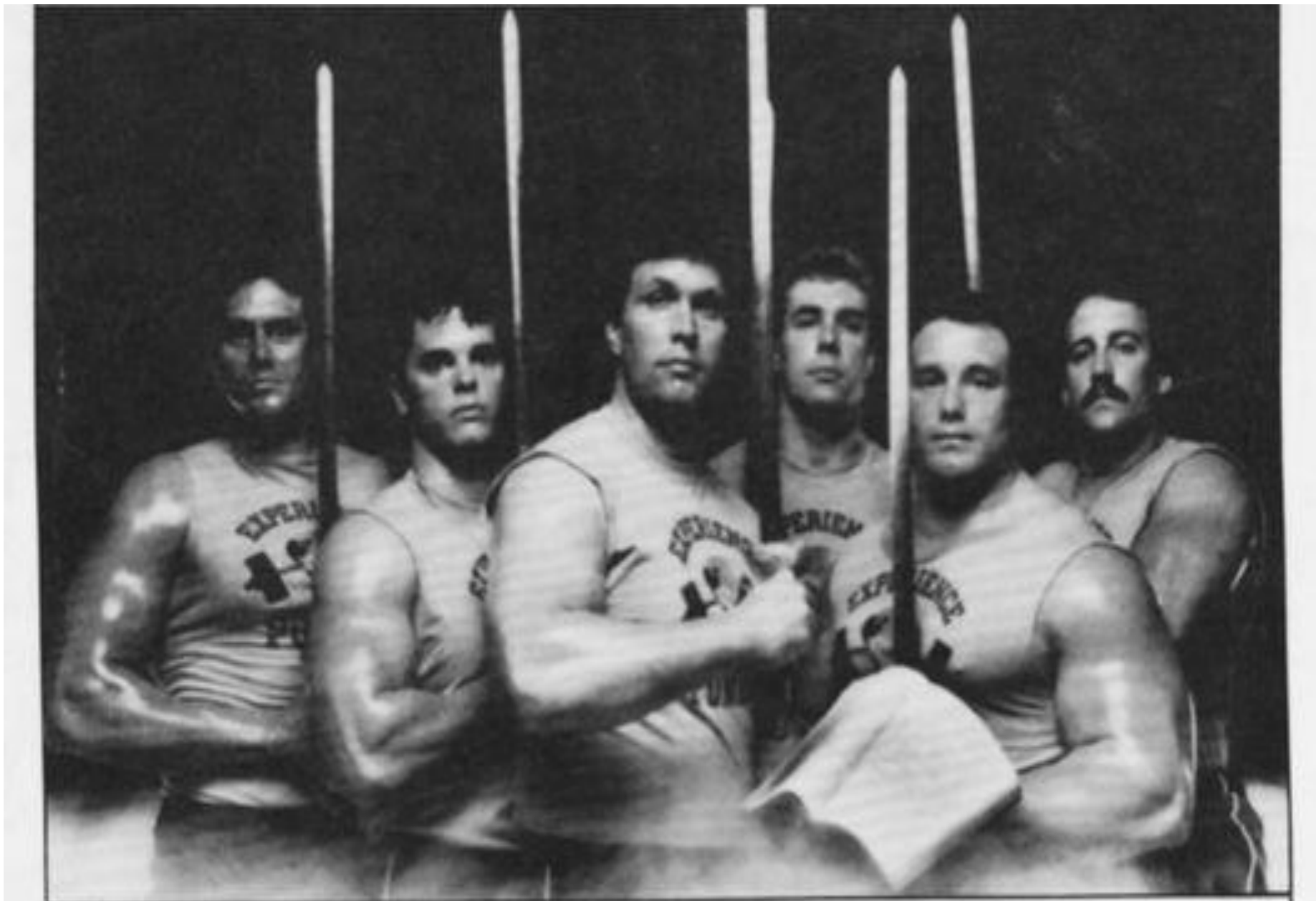
The Power Team