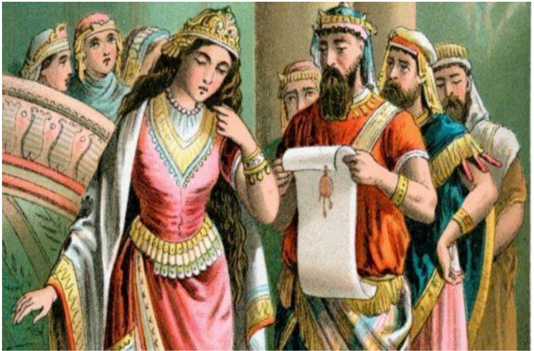
King Ahasuerus (Xerxes 1) dethrones Queen Vashti (Amestris)