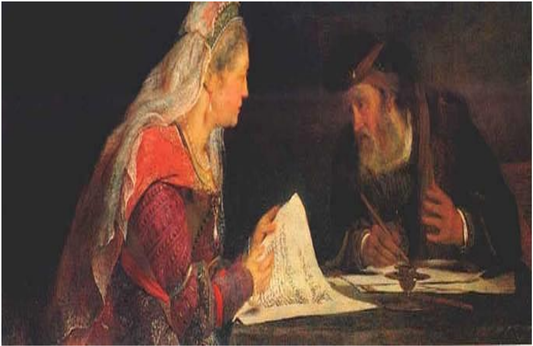
Esther talks with Mordecai through the messenger Hathach