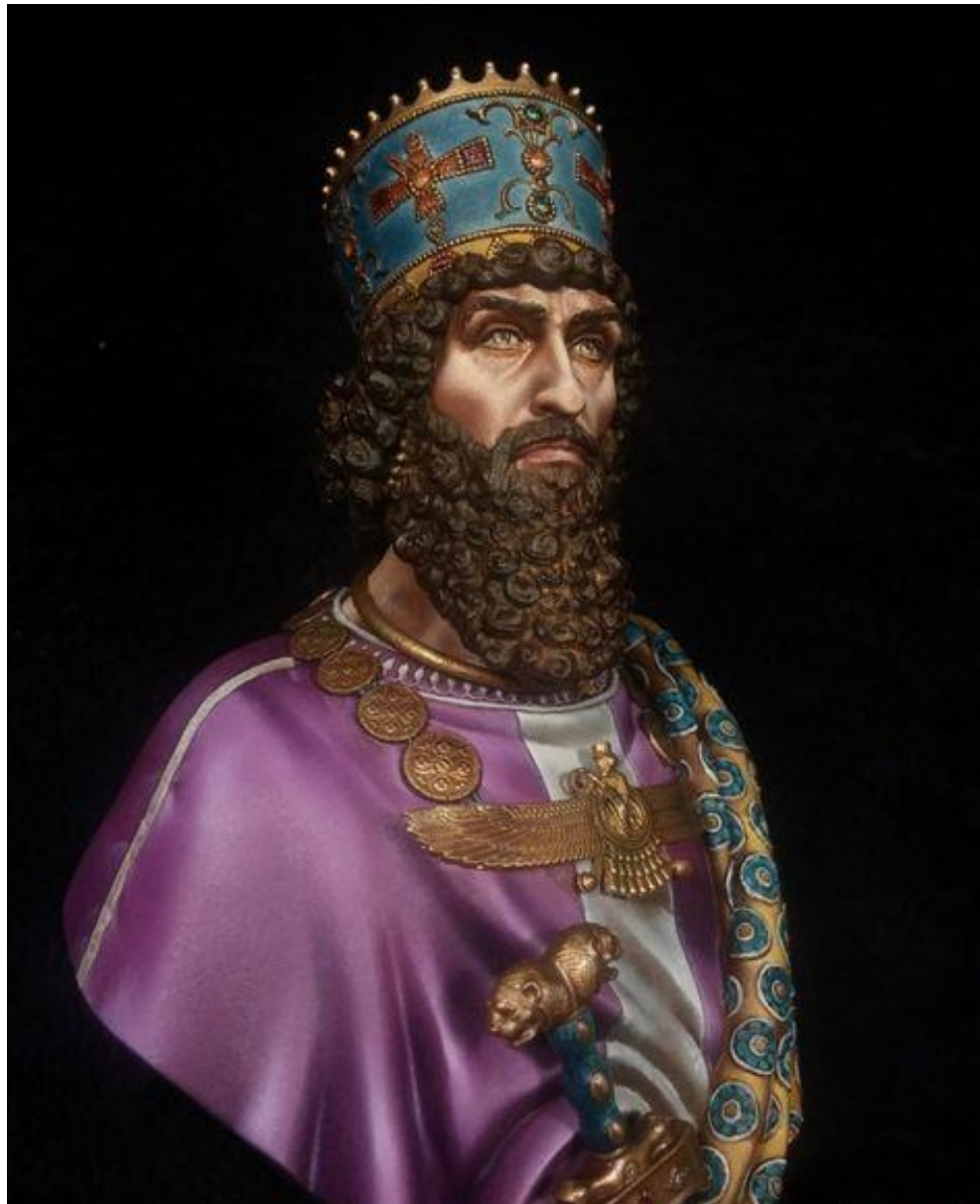
King Ahasuerus (King Xerxes 1) reigned 486BC-465BC