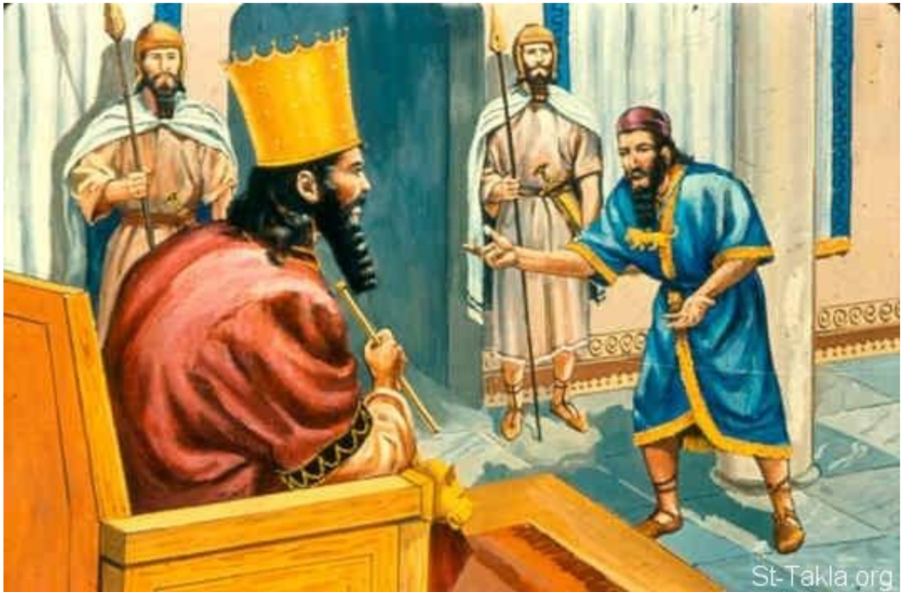
King Ahasuerus (Xerxes 1) instructs Haman to honor Mordecai