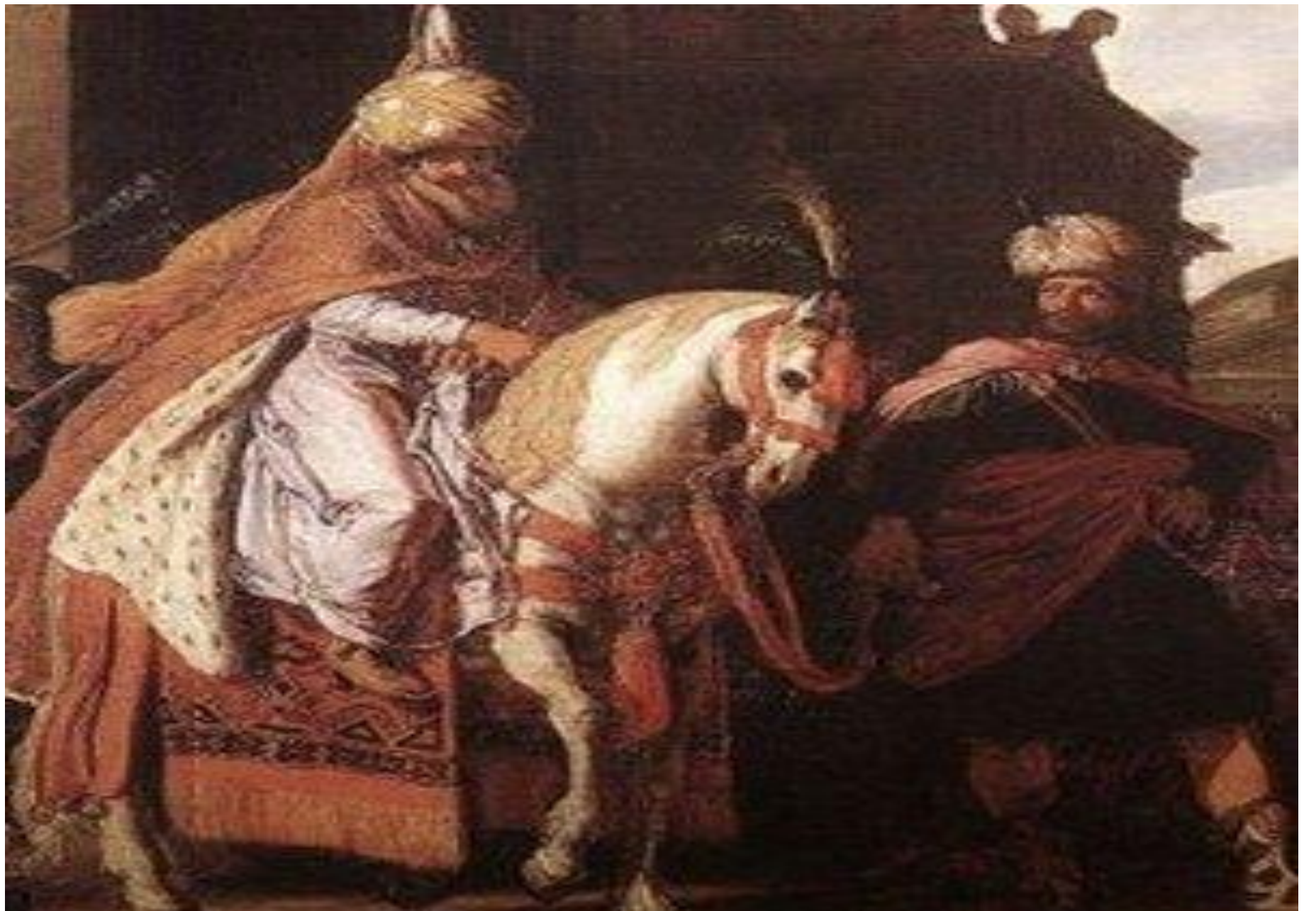
Mordecai is honored for saving the king's life