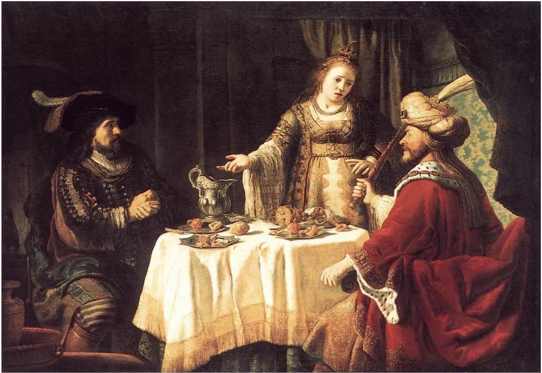
Esther's private royal banquet with King Xerxes 1 and Haman