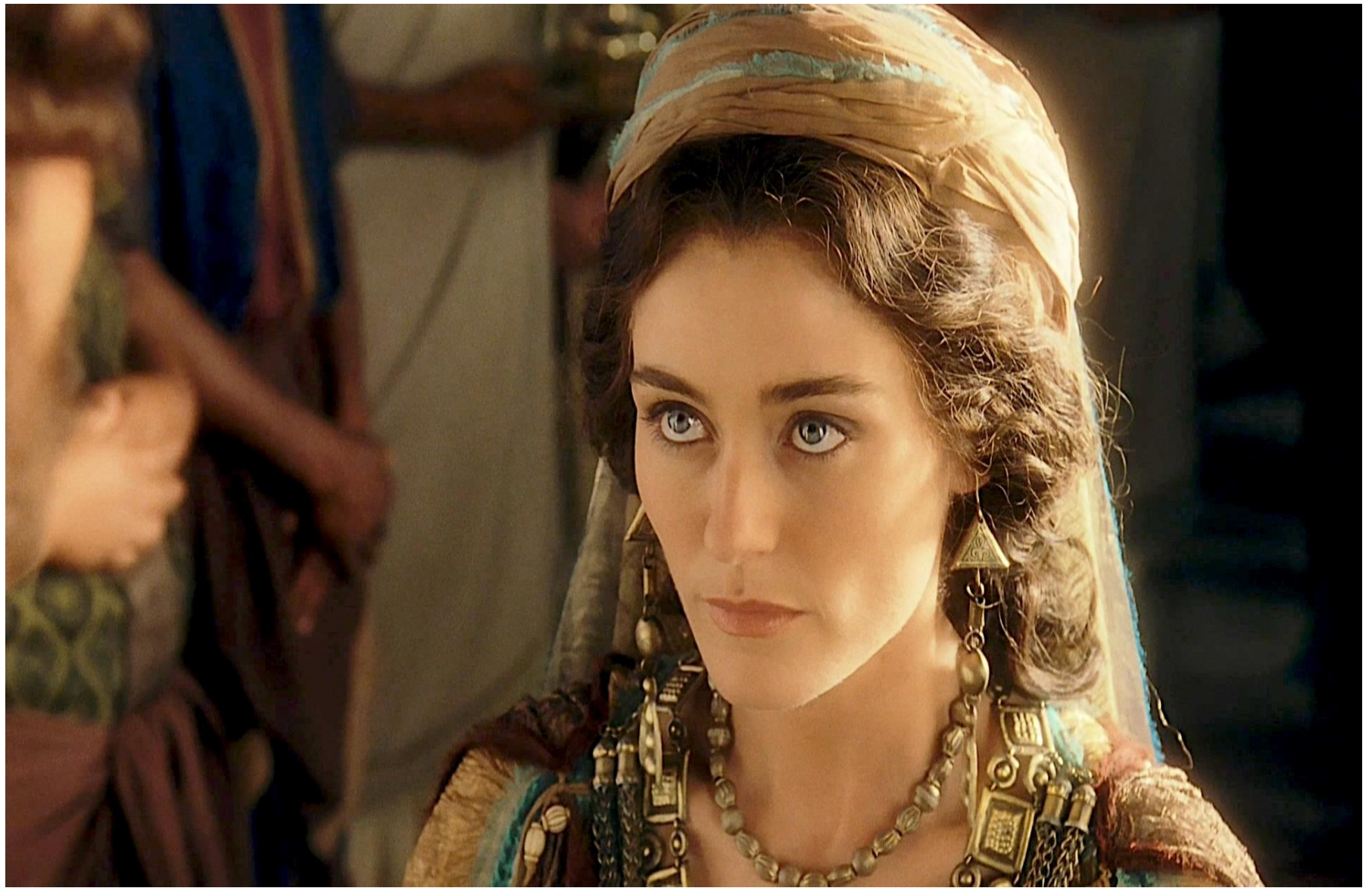
Esther's turn to stand before King Ahasuerus (Xerxes 1)