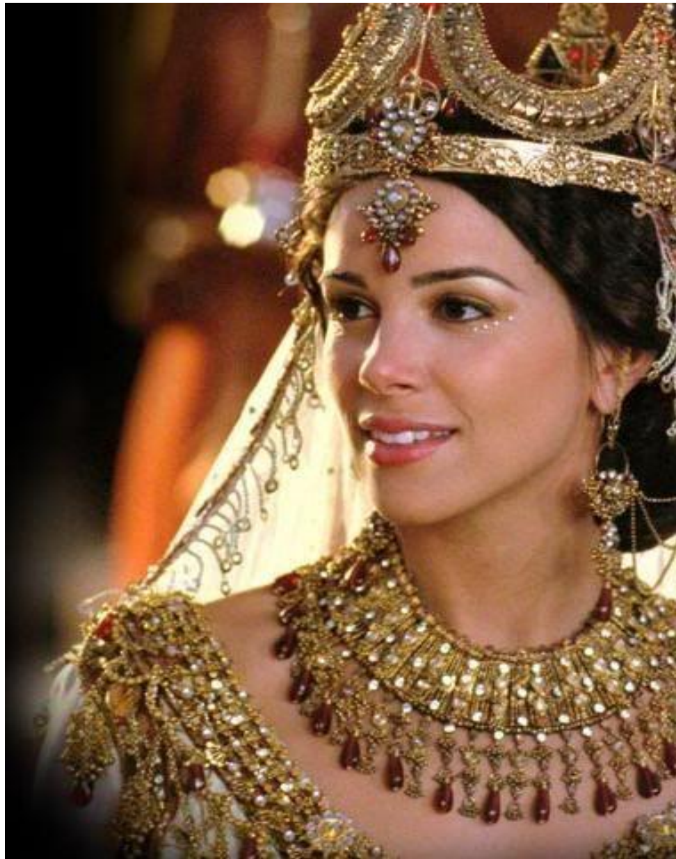
King Xerxes 1 crowns Esther (Hadassah) as his new queen