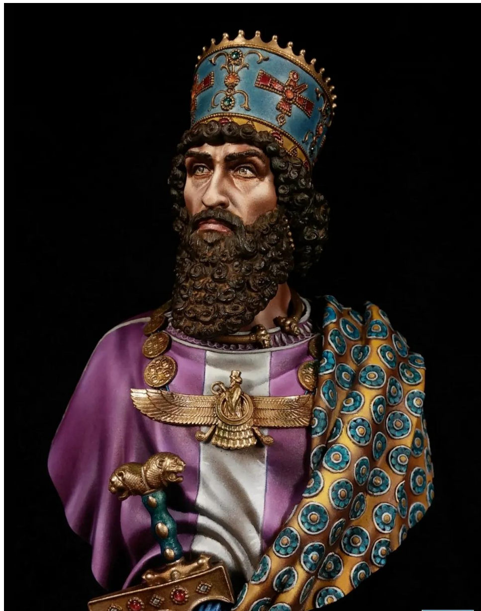
King Ahasuerus (King Xerxes I) reigned 486BC-465BC