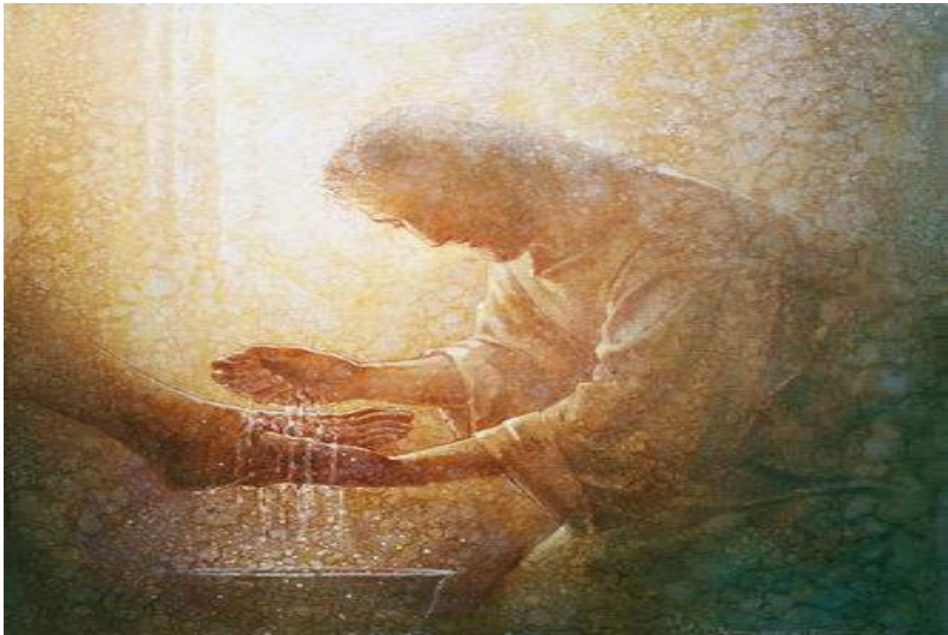
Jesus washes His disciples feet