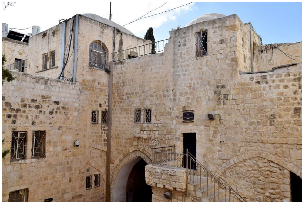
David's Tomb compound