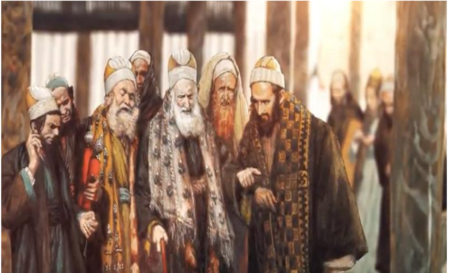
council of chief priests and Pharisees