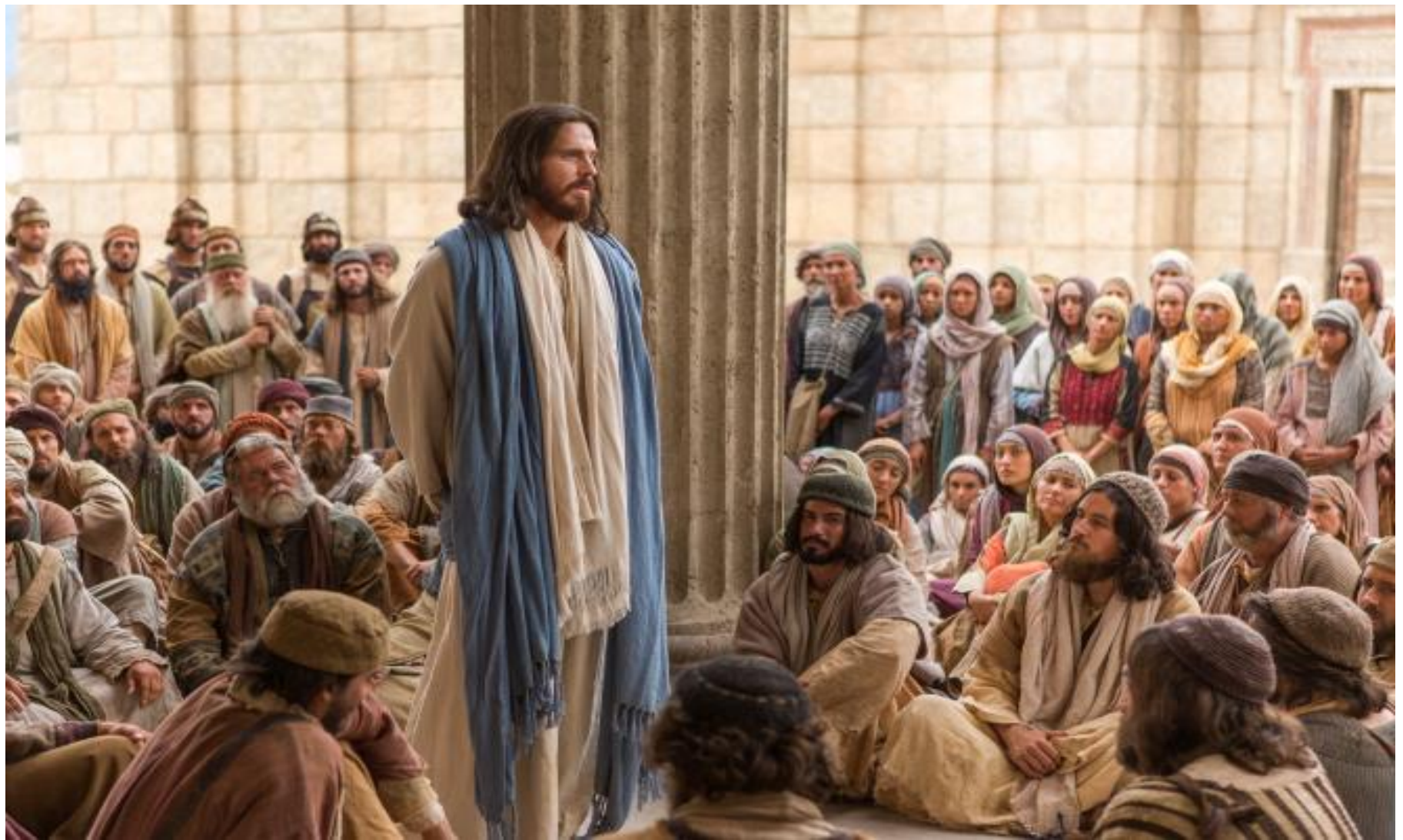
Jesus teaches the people and Pharisees in the Temple (the day after the Feast of Tabernacles)