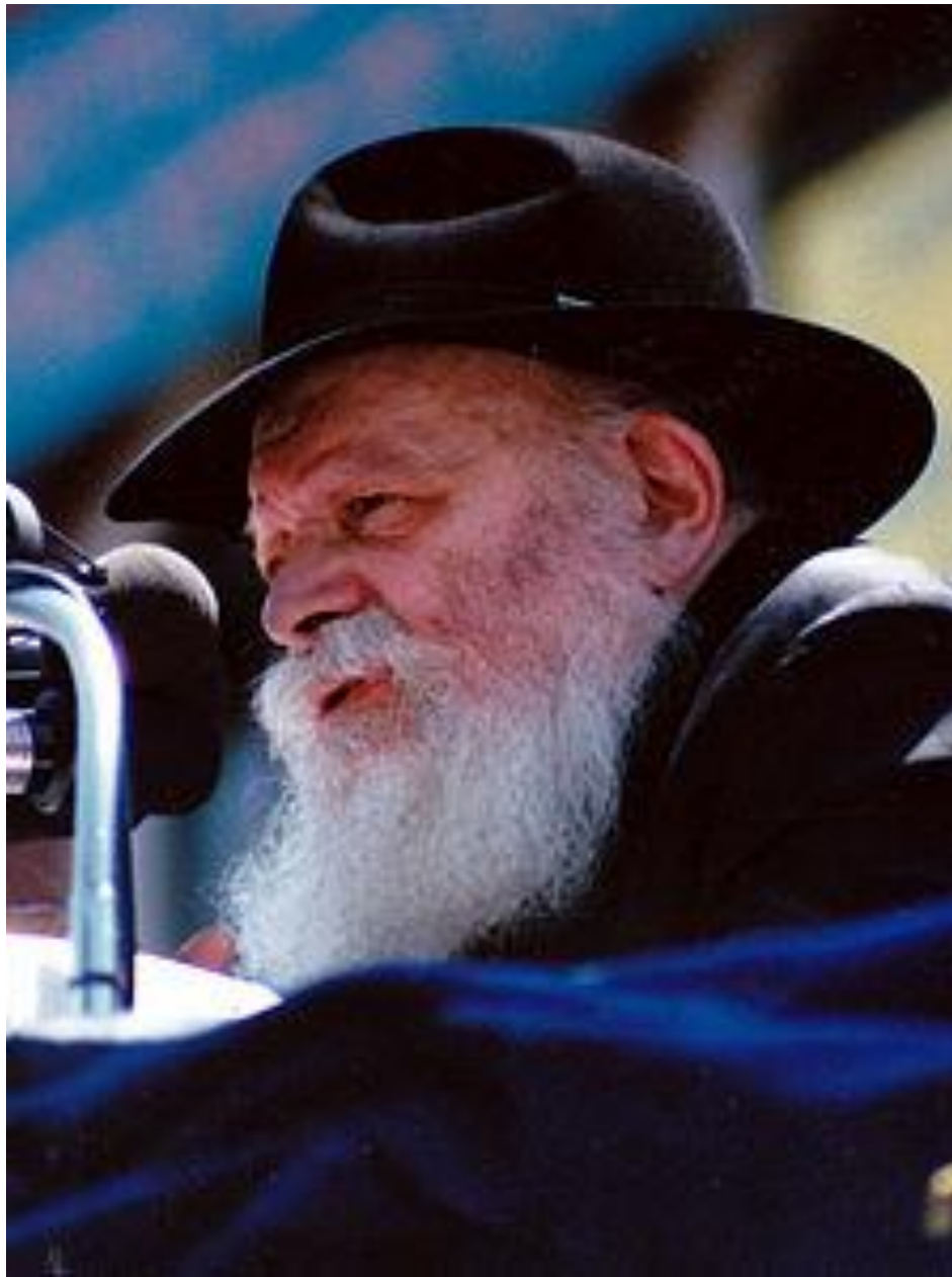
Rabbi Menachem Mendel Schneerson