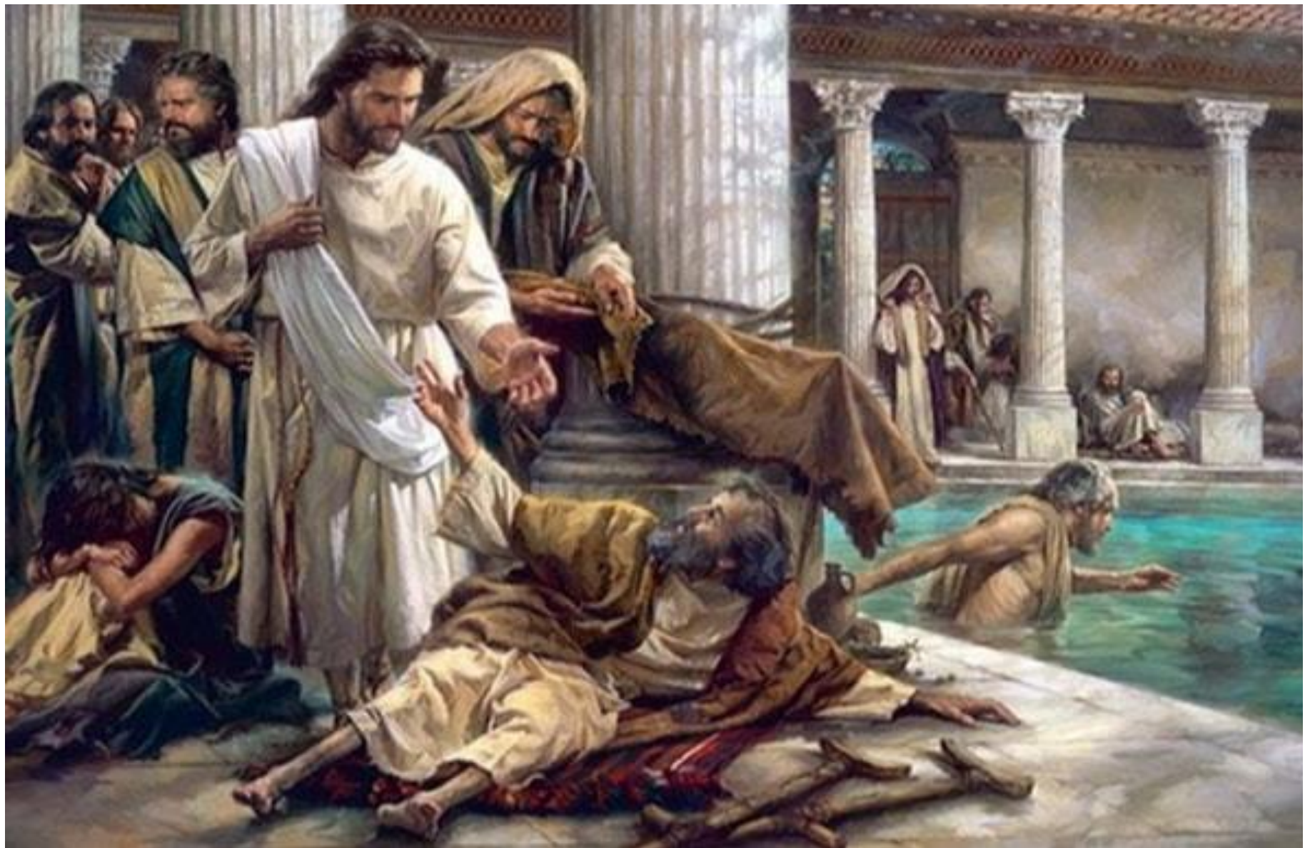
Jesus heals the Paralytic Man at the Pool of Bethesda