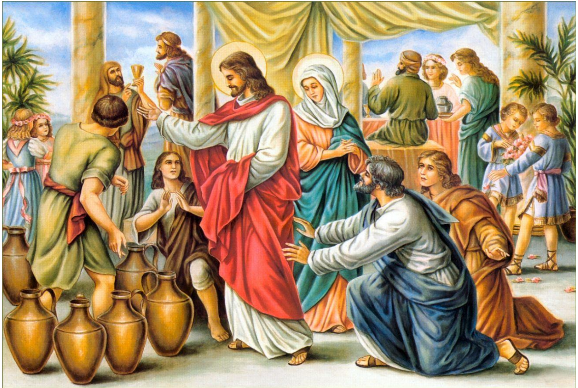
Jesus Christ changes water to wine