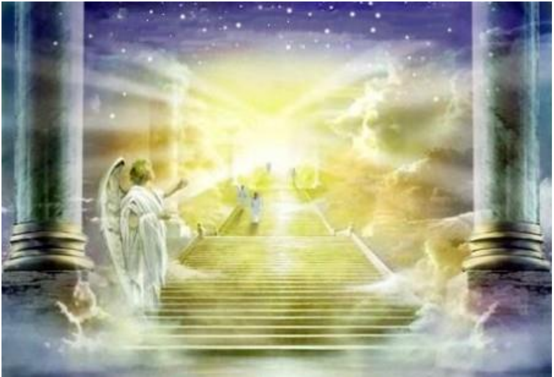
The Deity of Christ