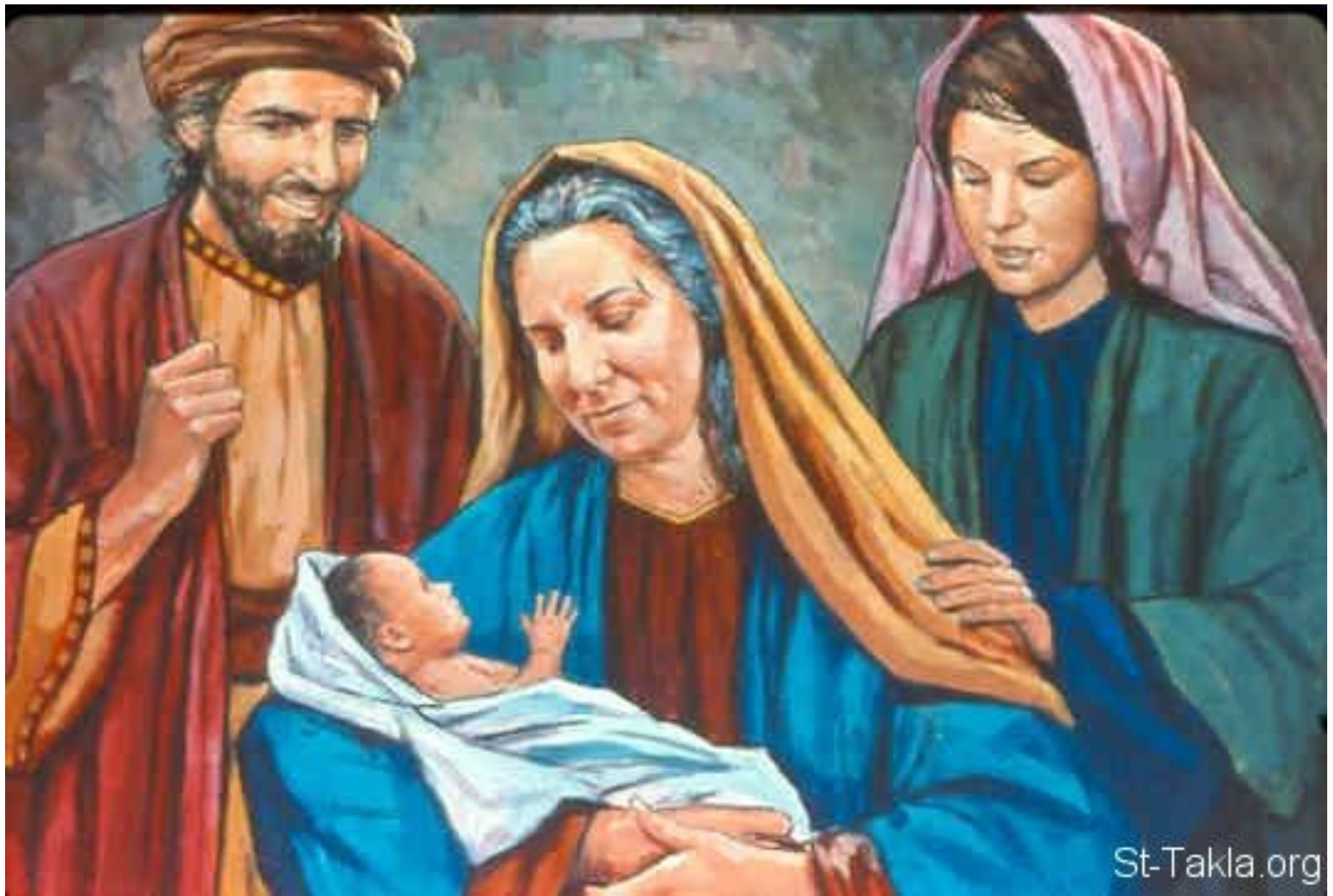
Obed is born