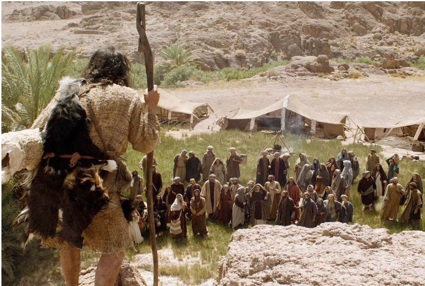
John “the baptizing one”