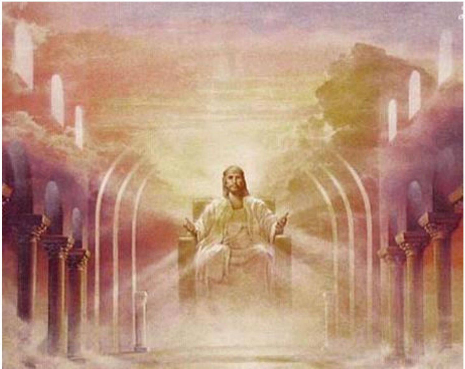
Jesus sitting at the right side of the throne of the Father