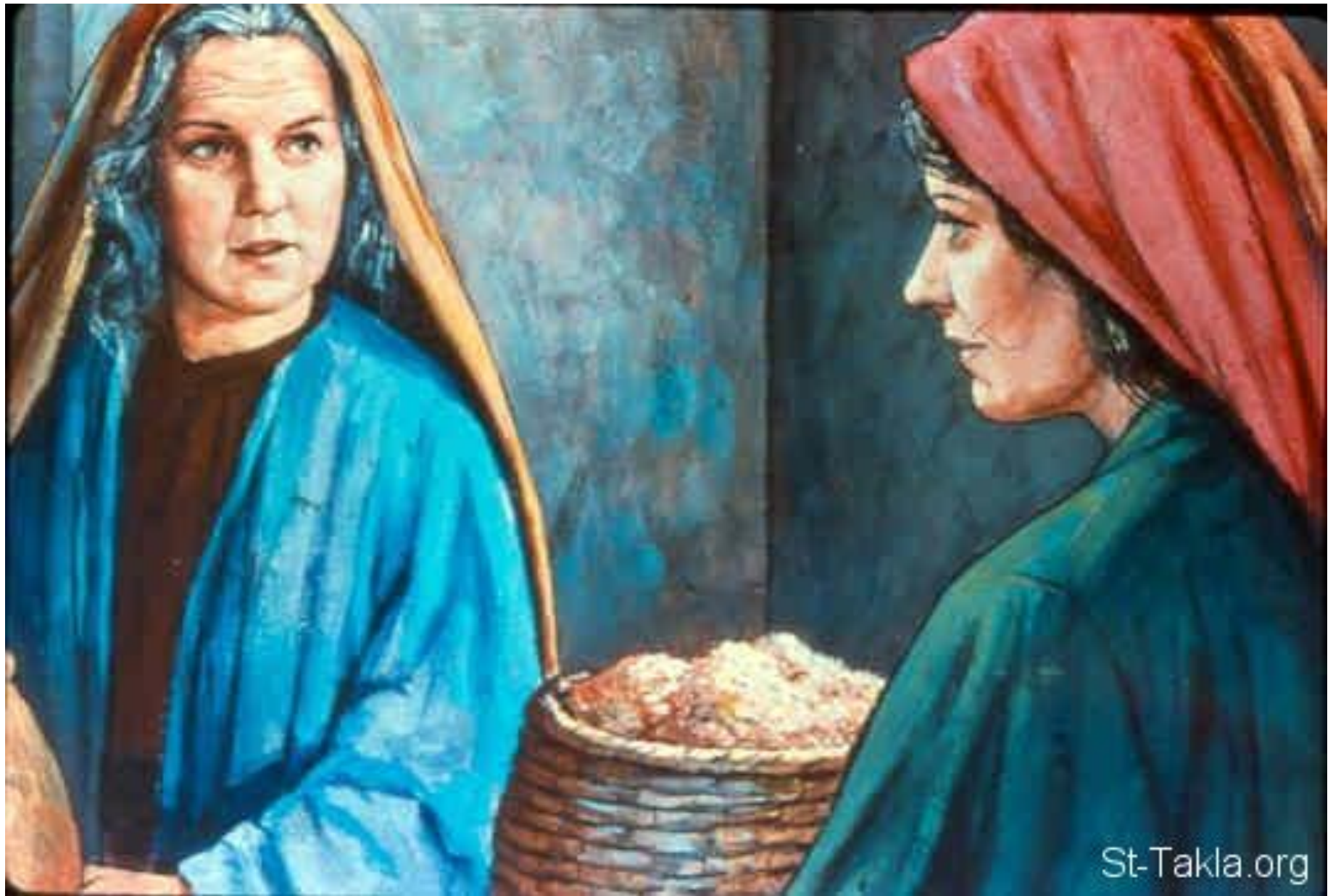
Naomi & Ruth