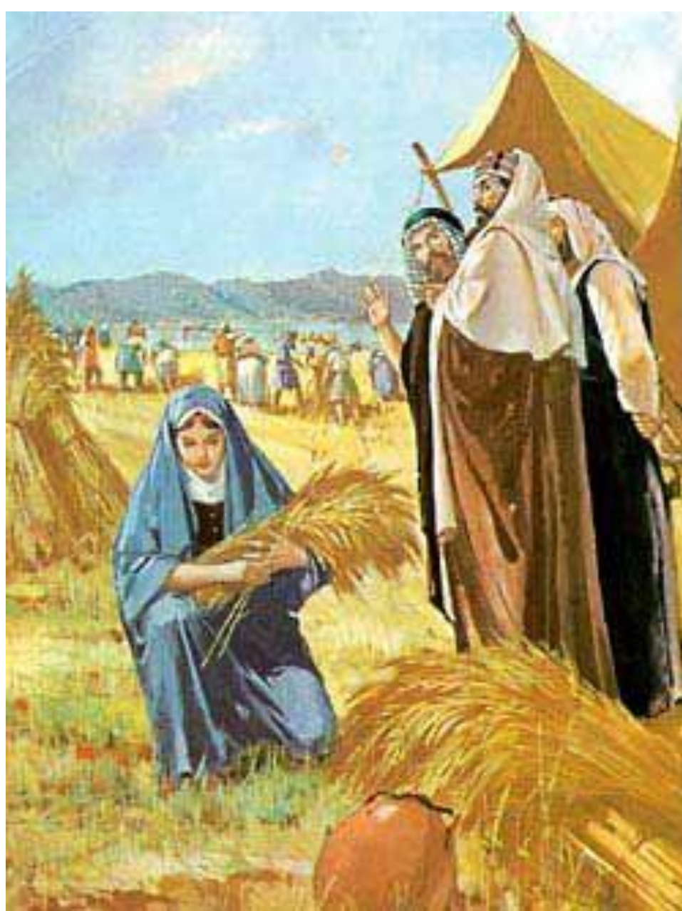
Ruth meets Boaz