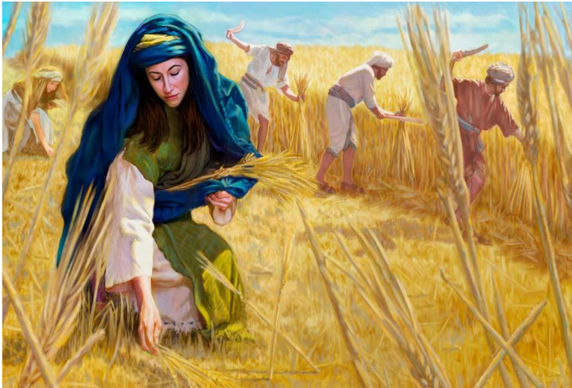
Ruth is gleaning wheat/barley in the fields