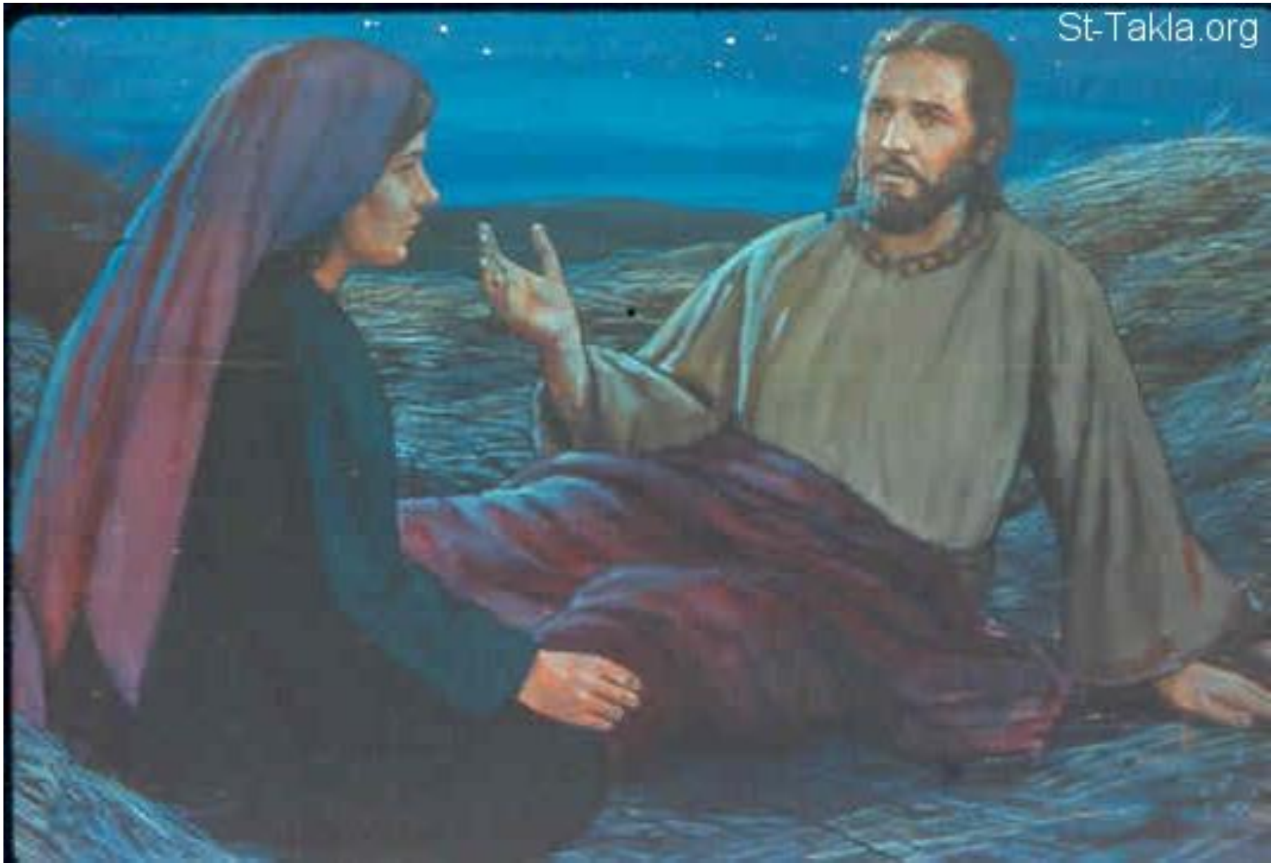
Ruth meets Boaz at night