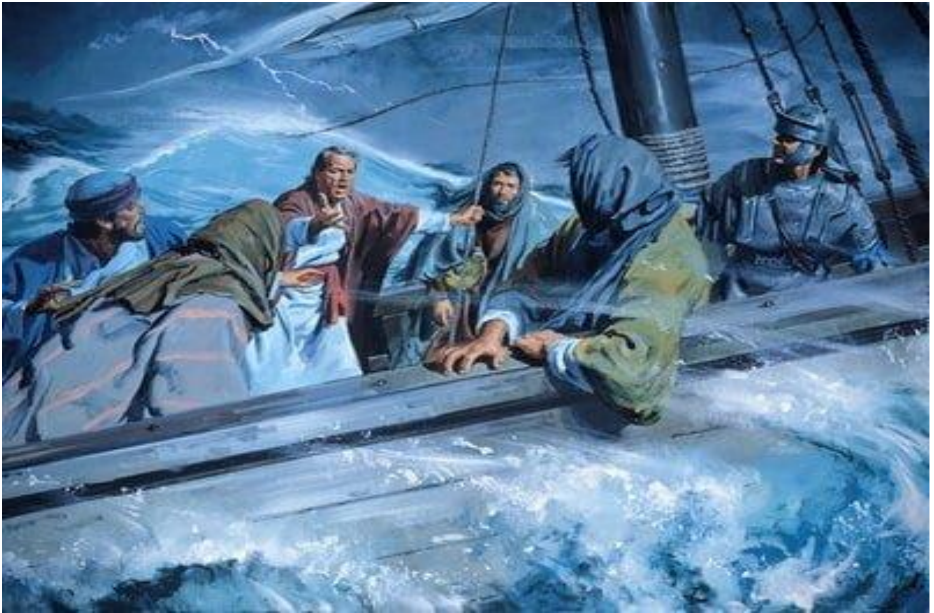
storm at sea