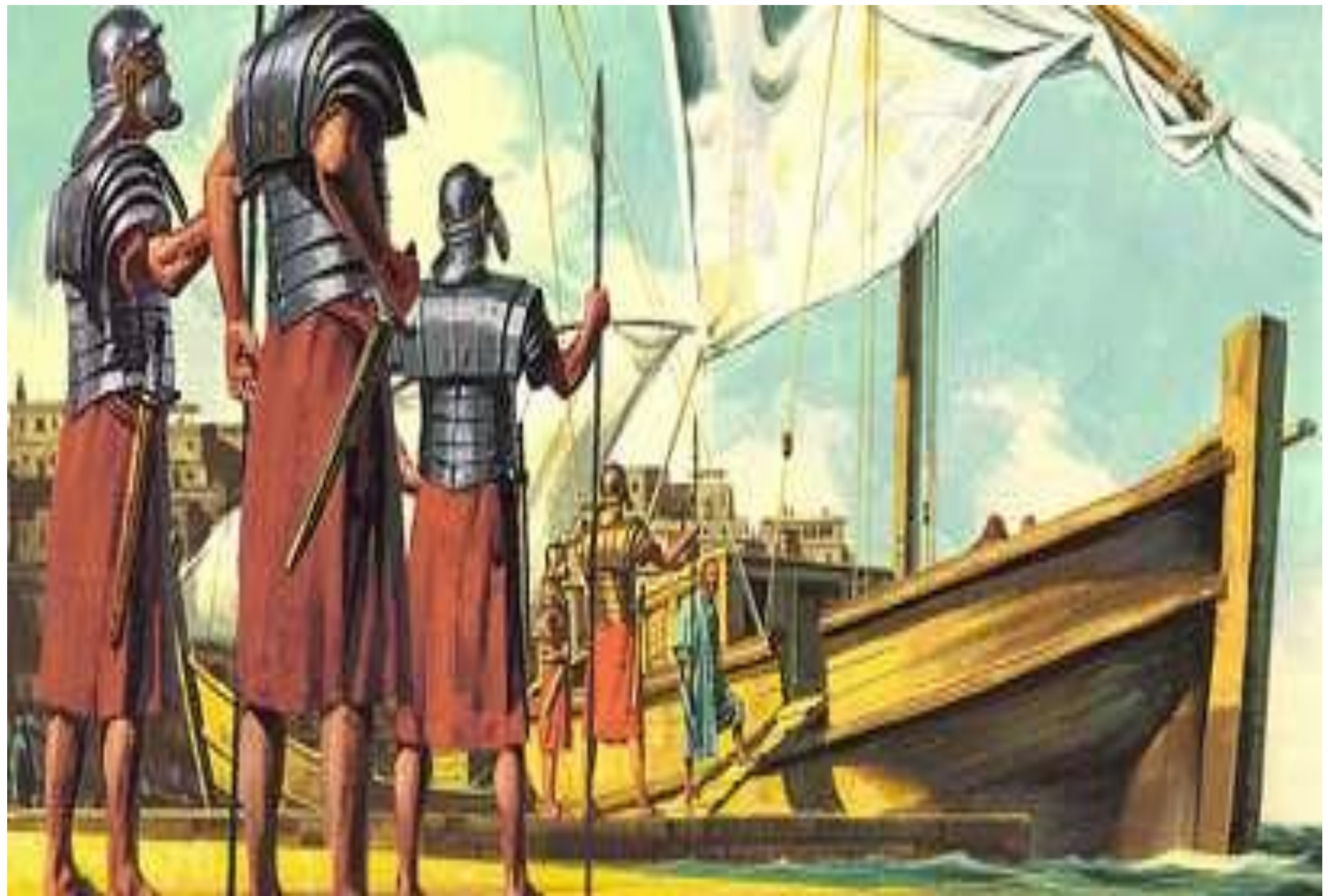
Paul boards ship to Rome